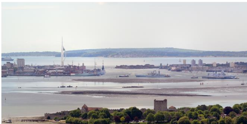
Portsmouth Harbour with the Solent and Isle of Wight in the background and Portchester Castle in the foreground

Further information and advice about accommodation will be posted on the Dickens Fellowship Website in due course.